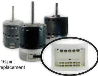
Constant CFM 16-pin, ECM 2.0, 2.3, EON replacement