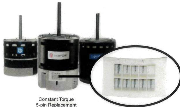
Constant Torque 5-pin Replacement